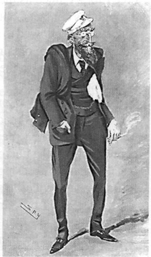
Figs 3 & 4 - Spy cartoons from 1878 and 1908