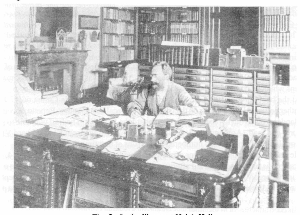
Fig. 5 - In the library at Haigh Hall