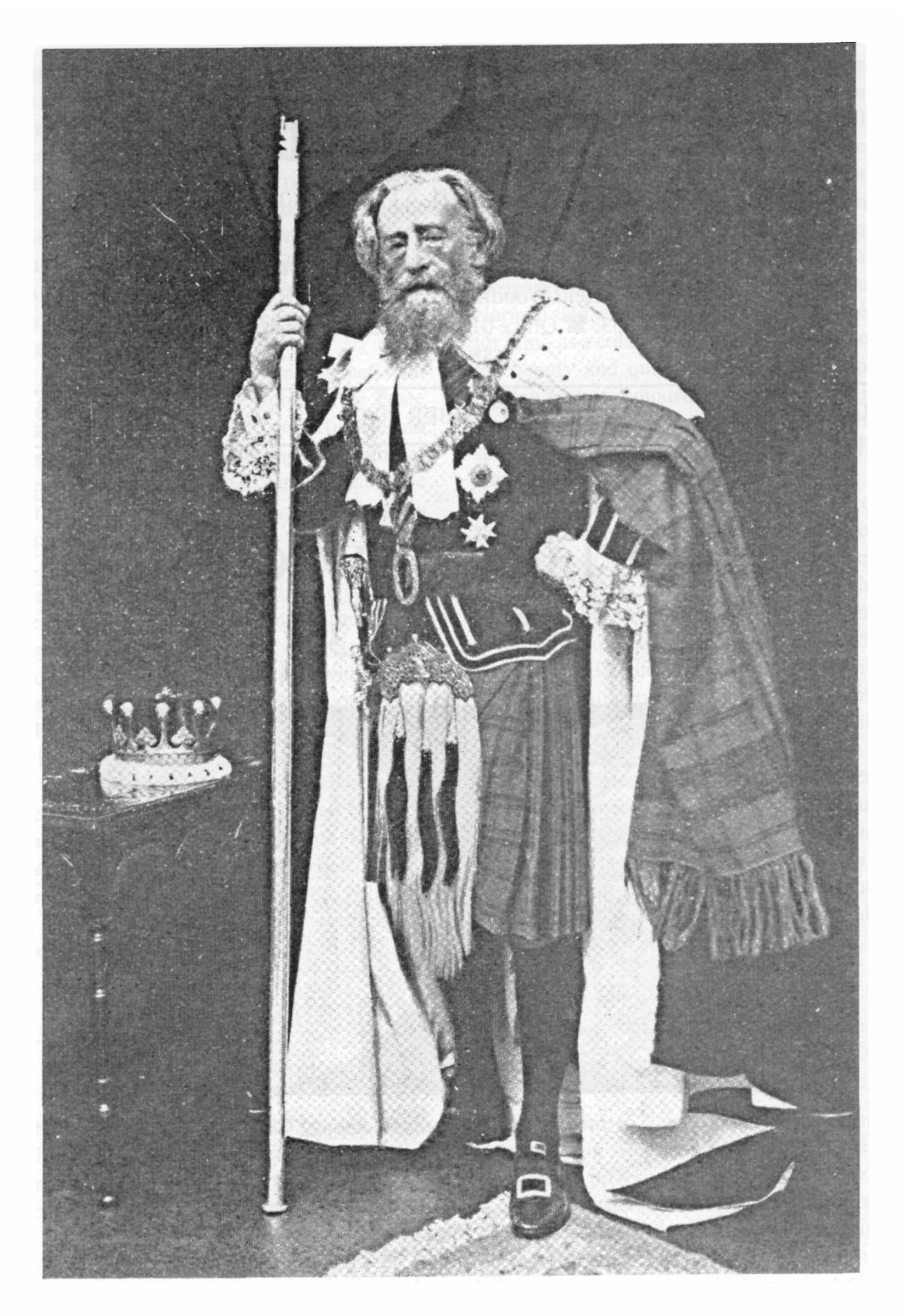
The Earl of Crawford in robes as the Deputy High Steward for Scotland