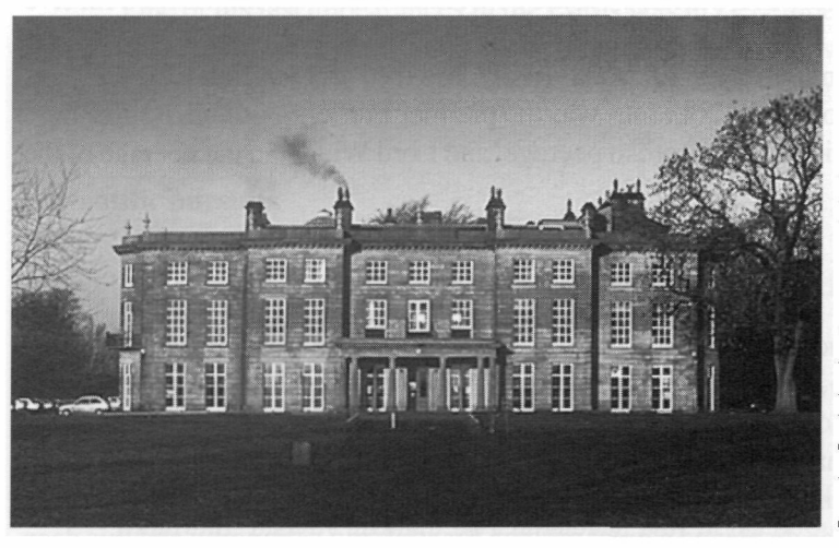
Fig. 1 - Haigh Hall today

The village of Haigh, on the north-eastern perimeter of Wigan, is dominated by its Hall.