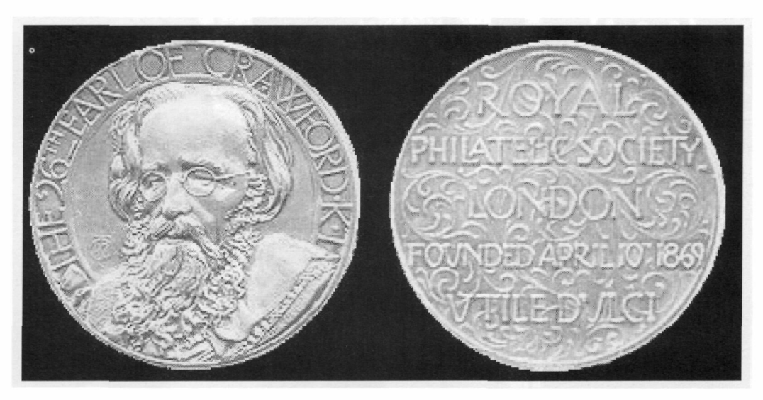
Fig. 11 - Crawford Medal. See p22.